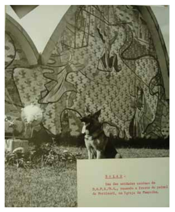
Figure 4 - The DOPS dog and the modern church 56