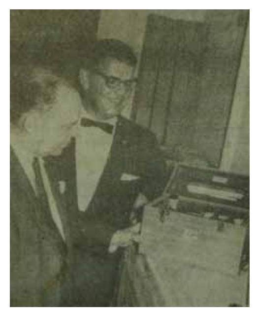
Figure 1 – Mitrione and Secretary of Security of MG <sup>20</sup>

such as changes in police uniforms and the improvement of traffic control rules. Realizing the interest of his colleagues from Minas in learning modern automobile traffic techniques, and wanting to increase his own value, he asked his superiors to send him a specific course on the subject from the US.