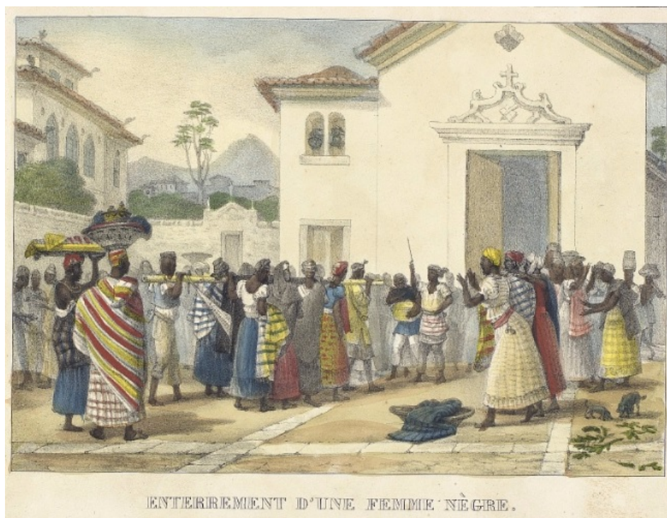
Figure 1 – ‘Funeral of a Black Woman’ of Jean-Batiste Debret. In the background, the Church Nossa Senhora de Lampadosa.