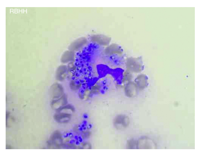
Figure 2 – Peripheral blood smear with several yeast cells of Histoplasma capsulatum and one monocyte.

The blood culture sample was further cultivated and the presence of H. capsulatum was confirmed. The anti-HIV test result was positive.