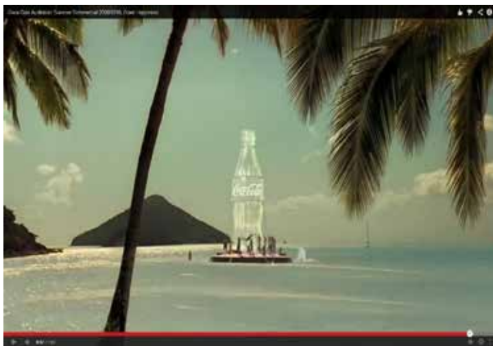
Figure 2: Coca-Cola ad: Summer commercial: Open Happiness

With regard to the storyworld projection in this ad, we can argue that since the bottle cannot be seen as such at the beginning of the ad, and, furthermore, it is empty, that is, it is the young people who open Coca-Cola bottles inside the floating artifact, the audience has to reinterpret the narrative. Thus, the initial narrative which shows young people enjoying themselves on the beach on an indeterminate floating artifact, is reinterpreted as a narrative where the Coca-Cola drink is the facilitator of this enjoyment and happiness. From an ideological point of view, however, it invites the critical reader to perceive a stereotyped and trivialized representation of youth, interested in enjoyment and sexual pleasure.