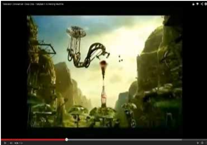
Figure 1: Coca-Cola ad: Fairy tale in a vending machine

CLAUSNER AND CROFT, 1999). Following Johnson (1993, p. 169) the basic mapping exists “between the three domains of spatial movement, journeying, and story structure, based on the underlying SOURCE-PATH-GOAL schema [...] The SOURCE-PATH-GOAL schema is thus the basis for our sense of stories as both literal or figurative journeys.” Johnson further argues that there is a STORY IS A JOURNEY metaphor. In our example, it becomes the STORY OF COCA-COLA PRODUCTION IS A MAGIC JOURNEY metaphor, which represents the creative re-contextualization of the conventional metaphor (HIDALGO-DOWNING & KRALJEVIC MUJIC, 2013). This motivates the metaphorical interpretation of co-occurring images and music, such as the fantastic creatures inside the vending machine or the music coming out of the Coca-Cola bottle, thus creating patterns of the extended metaphor COCA-COLA IS A MAGIC POTION. To sum up, the metaphor emerges through the development of the two storylines, the narrative lines lead to the metaphor, but the represented consumer is unaware of the MAGIC POTION metaphor, he simply feels something has changed.