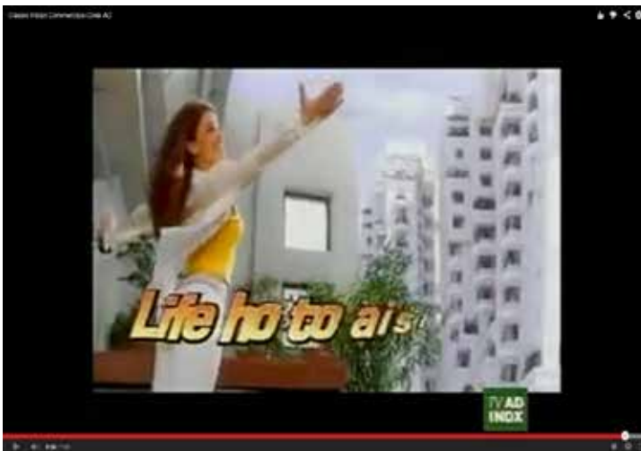
Figure 3: Coca-Cola ad: Classic Indian Commercials-Coke ad

world frame of a music recording studio with two children who are looking through a door into the studio. The storyworld projects a public frame. This is made explicit by the sign: ON AIR. When the children enter the studio unnoticed, the Coca-Cola music starts. They open bottles of the advertised product and start playing the Coca-Cola music with the instruments. The music is combined with the sound of the Coca-Cola drinking. The face of Aishwarya Rai, a famous Indian actress appears, and the spectator has to revise the studio framing, as it shifts from the public to the private frame. We can see that she is in her own apartment listening to the music. In the meantime, both she and the children are drinking Coca-Cola .