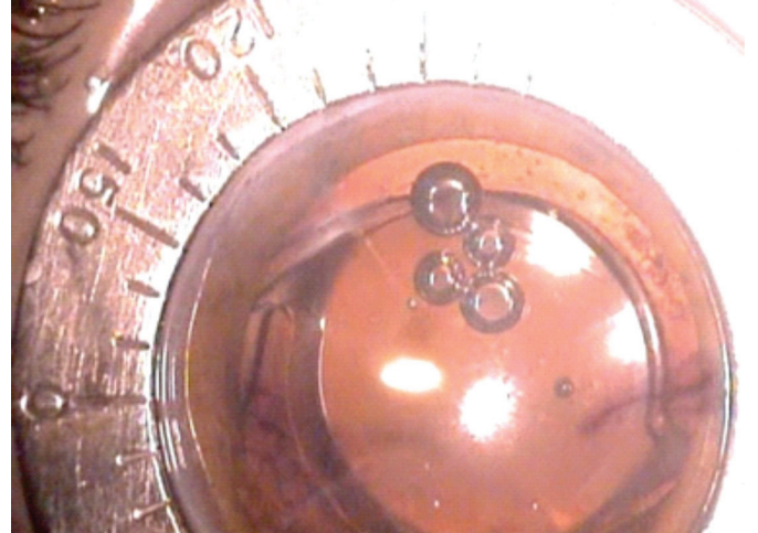
Figure 3: Immediate postoperative period. Note the overlap of the Sulcoflex™ IOL haptics with the primary IOL haptics.

LASIK that they induce reduced fluctuations in daily vision (8) because they can correct higher order aberrations. However, several authors agree that these alternatives are only valid for mild and moderate hyperopia (up to approximately 5.00D) (9-12) .