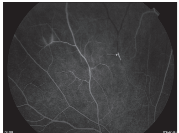
Figure 2: Fluorescein angiogram on the right eye shows obstruction of perfusion caused by serous deposit along the vessel wall known as Gass plaques (arrow); revealed also leaking in arterioles characterizing vasculitis