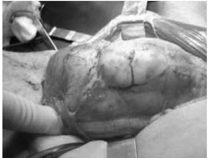
Figure 4 – Intraoperative photograph of the tumor.