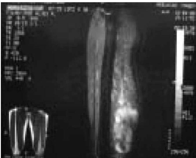
Figure 3 - MRI image of the tumor.