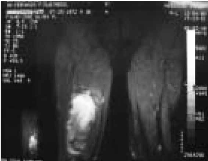
Figure 1 – MRI image of the tumor.