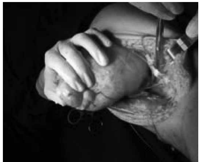
Figure 5 - Intraoperative photograph of the tumor.