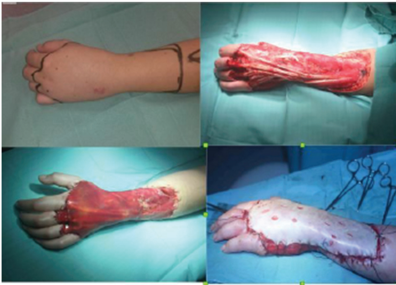
Fig. 4 Transoperative period of tumor resection. A, intraoperative marking; B, wide resection; C, reconstruction with dermal matrix; D, second surgical time with total skin graft.