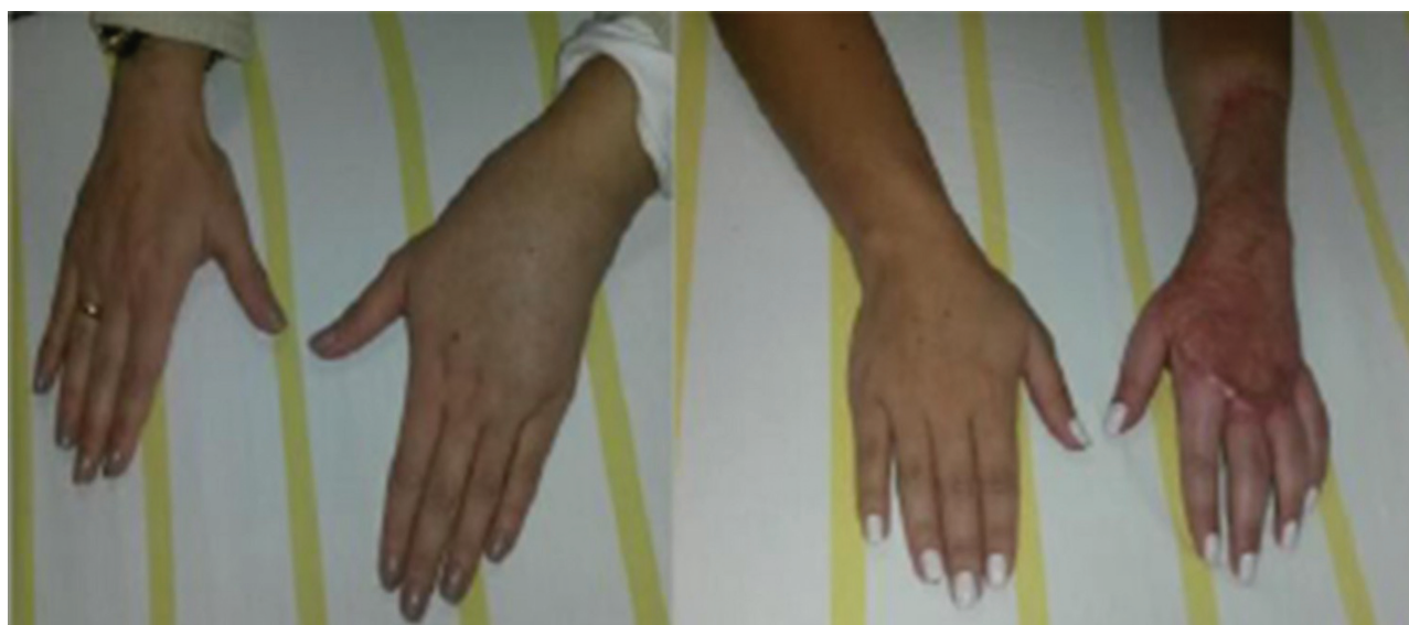
Fig. 1 A, admission; B, 1 st month after the surgery.

Depending on the degree of cellularity, nuclear pleomorphism, and mitotic activity, myxofibrosarcomas are classified into three histological grades: low, intermediate, and high grade. 1,2 In the present case, the nonspecific physical and imaging features initially led to the misdiagnosis of a benign lesion, delaying treatment for > 2 years. The MRI scans showed characteristic images, such as the high signal in T2-weighted images seen in myxoid tumors, and a low signal in those with fibrosis. Although the nuclear magnetic resonance (NMR) findings did not confirm the diagnosis, they helped the surgical planning.