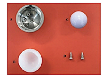
Fig. 1 Example of prosthetic assembly with metal femoral head