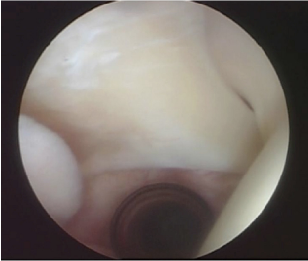
Fig. 2 – Arthroscopic image showing the origin of the long head of the biceps on the lower surface of the supraspinatus tendon.

the biceps, in the rotator cuff. In the variant described by Lang et al., 8 the biceps originated in the rotator head without an annex going to the upper labrum and this case presented a partial articular lesion of the rotator cuff. These authors observed that the biceps was not diseased and they therefore left it intact. They reported that complete resolution of the symptoms was achieved through arthroscopic repair of the rotator cuff.