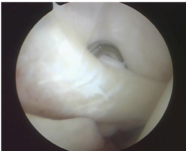
Fig. 3 – Another arthroscopic view, with the probe at the insertion of the biceps.

Other intra-articular variants that have been described include a bifurcated origin of the biceps in the supraglenoid tubercle and posterosuperior labrum, a tendon of the biceps bifidus with a single origin in the supraglenoid tubercle and a tendon of the biceps that went through the supraspinatus tendon. 9 Ogawa and Naniwa 10 raised the hypothesis that if the tendon of the biceps passes through the supraspinatus tendon, this may contribute toward tearing of the rotator cuff.