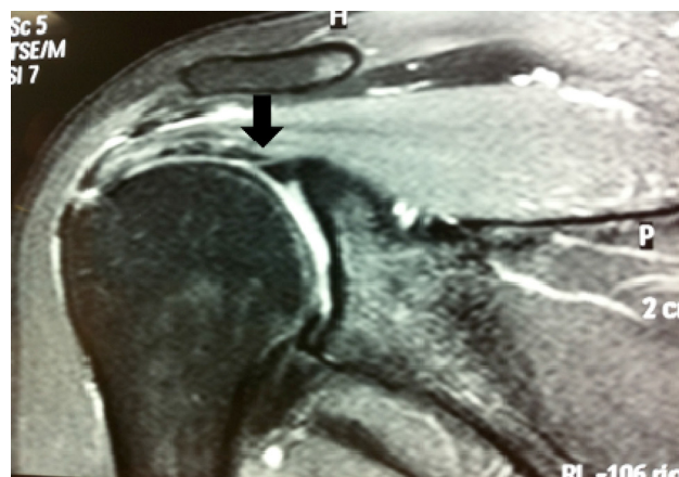
Fig. 1 – Coronal slice from magnetic resonance imaging, highlighting the anomalous origin of the long head of the biceps.

One year after the first treatment, magnetic resonance imaging showed a lesion that affected 40% of the supraspinatus tendon. The conservative treatment was continued, using an injectable corticosteroid (three intramuscular injections of dexamethasone, every 15 days) and physiotherapeutic rehabilitation. After two years of treatment, he still presented