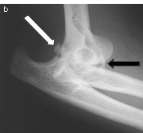
Fig. 1 – Anteroposterior (AP) radiograph of a dislocated left elbow (case 10). White arrow, fragment of the fracture of the coronoid process. Black arrows, fragments of the fracture of the radial head (a). Lateral radiograph of a dislocated left elbow (case 10). White arrow, fragment of the fracture of the radial head. Black arrow, fragment of the fracture of the coronoid process (b).

The patients' mean age at the time of the treatment was 41 years and four months, with a range from 21 to 66. Nine (60%) were male and six (40%) were female. The dominant side was affected in eleven cases (73.3%) (Table 1).