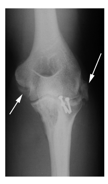
Fig. 4 – Anteroposterior (AP) radiograph of the left elbow (case 10), seven months after the operation. White arrows, heterotopic ossification.

In our series, the mean quantitative Bruce score for the patients affected on the dominant side was 86 points, while for the other group, the value was 80. There was no statistically significant difference between these two groups (p = 0.201).