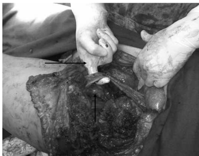
Figure 3 – Photo of the internal hemipelvectomy surgery showing the preservation of the femoral vascular-nervous bundle anteriorly and of the sciatic nerve posteriorly.