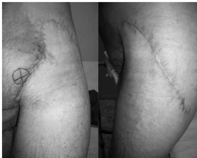
Figure 2 – Operative wound of a patient who underwent left internal hemipelvectomy 100 days ago. Incision was made in inverted V.

Obtaining surgical margins similar to that of a classic amputation, the lack of tumor involvement in the femoral vascular-nervous bundle and the sciatic nerve, preserving partial function of the lower limb, and the patient having favorable life expectancy