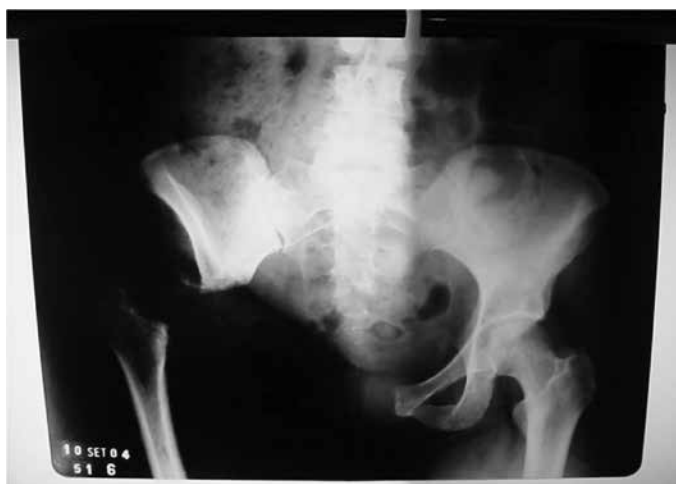
Figure 4 – X-ray of a patient previously submitted to right internal hemipelvectomy. Enneking II + III resection.