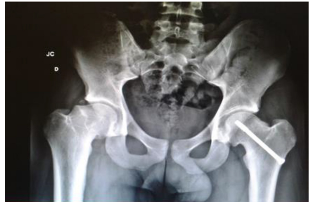
Fig. 5 – Radiographic image of the pelvis six weeks after arterial repair and screw removal.

The secondary objectives are to avoid the complications inherent to the pathology and to reduce the risks of early degenerative alterations.