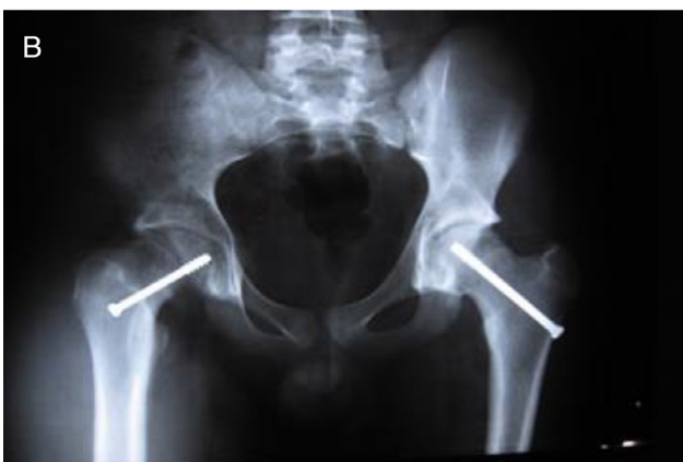
Fig. 1 – (A) Initial clinical image of the patient showing volume increase in the upper thigh; (B) radiographic image of the pelvis on admission to hospital.