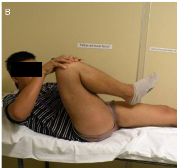
Fig. 4 – (A) Clinical aspect of the patient after six weeks, showing normal abduction; (B) hip flexion with a positive Drehmann's sign.