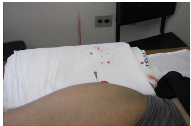
Fig. 2 – Thigh puncture, with a large quantity of blood freed under pressure.