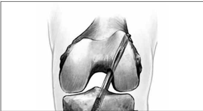
Figure 2 – EZLoc™ transfemoral fixation.

analysis, by means of Student's t test, the chi-square test and the nonparametric Mann-Whitney test.