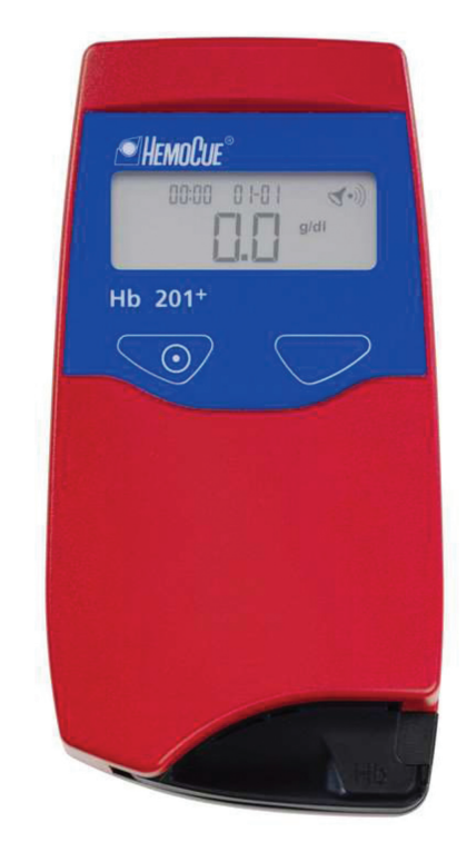
Fig. 1 Near-patient hemoglobin testing device.

In the anemia clinic, a full history, examination, and additional blood tests are performed. Patients undergo a