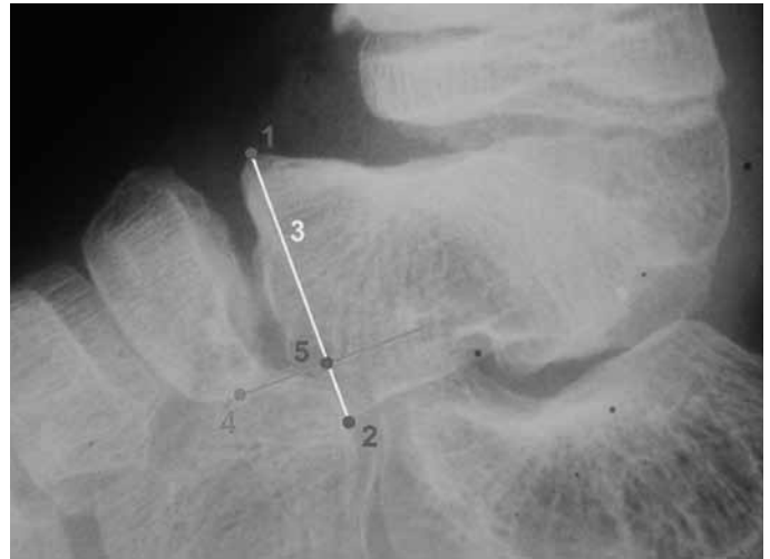
Figure 5 – Illustration of calculation of degree of navicular subluxation (explained in text).