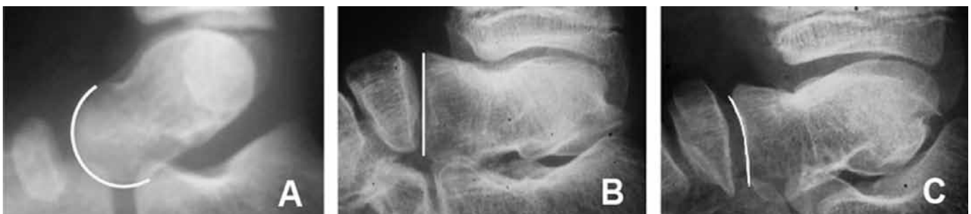
Figure 2 – Sphericity patterns for the talonavicular joint: talar head (A) convex; (B) planar; (C) concave.