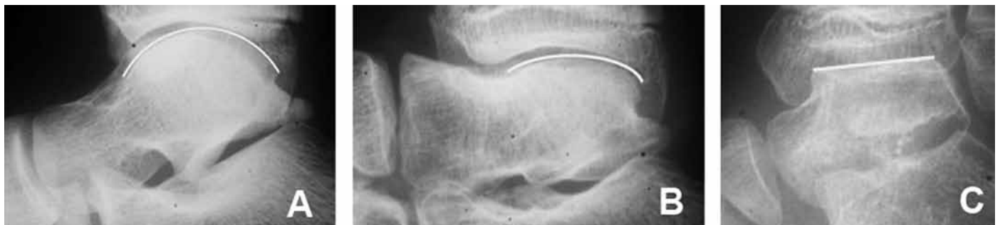
Figure 1 – Talar sphericity patterns: (A) normal, enabling good mobility of the joint; (B) slightly flattened; (C) greatly altered or flat.

The height and length were measured in the affected foot and the contralateral foot. A simple percentage