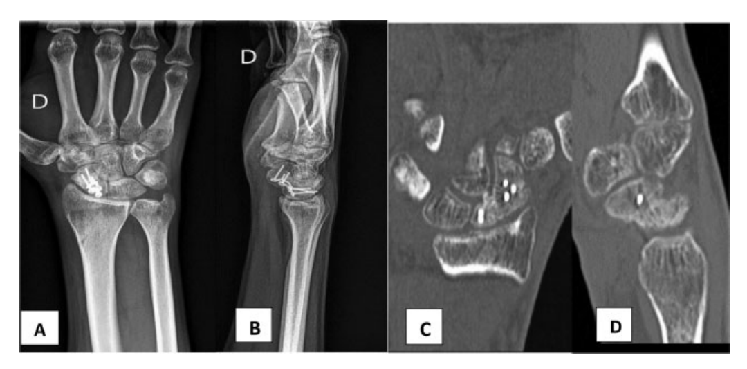
Fig. 2 Three months after surgery. (A) Anteroposterior radiograph showing a well-placed plate and consolidated pseudoarthrosis. (B) Lateral radiograph showing total integration between the fragments. (C) Frontal section of a computed tomography (CT) scan showing a bone bridge between the fragments. (D) Lateral CT image showing consolidation of pseudoarthrosis.

Abbreviations: CLPS, contralateral lateral pinch strength; EXT MCP THUMB, extension of the metacarpophalangeal joint of the thumb; FLEX MCP THUMB, flexion of the metacarpophalangeal joint of the thumb; LPS, lateral pinch strength; PREOP, Preoperative; RADIAL ABD THUMB, radial abduction of the thumb; RADIAL DEV, radial deviation; REST VAS, visual analog scale for pain at rest; ULNAR DEV, ulnar deviation; VAS ROM, visual analog scale for range of motion; W EXT, wrist extension; W FLEX, wrist flexion.