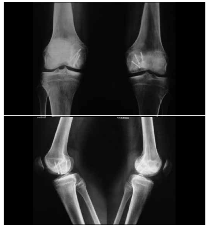
Figure 2 - Postoperative radiographs.