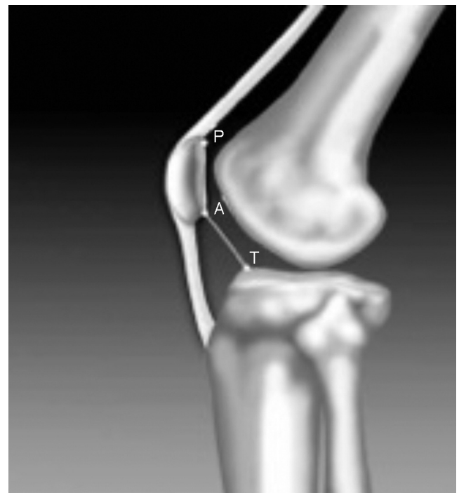
Fig. 2 – Measurement of the patellar height. It was considered high when AT/P > 1.2 .