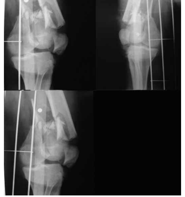
Figure 1 – Preoperative radiographs.

For all these reasons, this case of an exposed supra-intracondylar fracture of the femur in a motocross competitor was reported. The case was diagnosed and treated in accordance with the literature (Figures 1, 2 and 3).