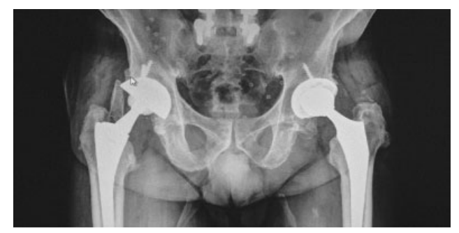
Fig. 4 Right-sided revision, 12 months postoperative.