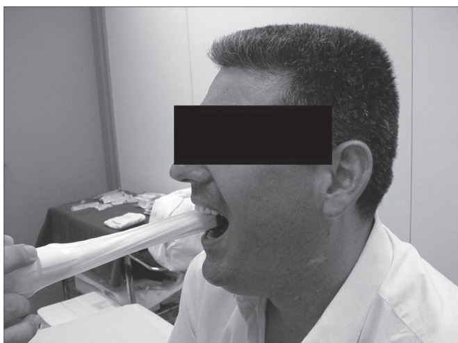
Figure 2. Intra-oral US done with the patient seated and with the mouth open, allowing contact between the intra-cavity transducer and the affected tonsil.