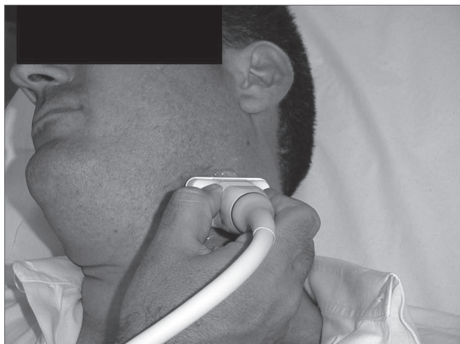
Figure 1. Transcutaneous US placed in the angle of the lower jaw with the patient in orthostatism and lateral rotation of the head.