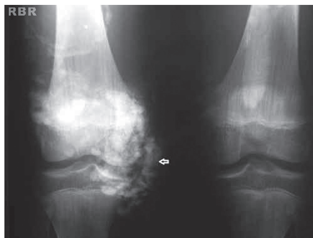
Fig. 1 – Calcinosis lesion on the right knee.

Calcinosis or calcifications of non-articular tissues are manifestations of some rheumatic diseases, such as dermatomyositis, systemic lupus erythematosus, systemic sclerosis and MCTD; these conditions can be painful and very debilitating, sometimes resulting in functional disability. 6 In a multicenter study conducted in Brazil with JDM and juvenile polymyositis patients, calcinosis were observed in 46 (24.3%) patients. These calcifications were localized in 29 patients, disseminated in 13, superficial in 23 and deep in 8 patients. 7 "Milk of calcium" is a