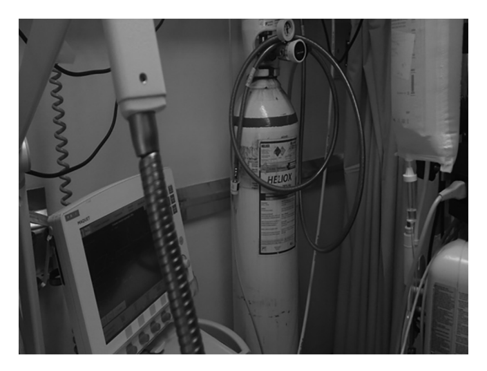
Figure 1 - Use of heliox (80:20) with a Maquet Servo-I ventilator.

Except for the Maquet Servo-i, volume readings are inaccurate on all ventilators because the flow meter is calibrated for air.<sup>(1)</sup> Furthermore, the dosing of the amount of administered aerosols is also affected by the type of gas used. It should be noted that no adverse effects associated with the use of He/O<sub>2</sub> have been described.<sup>(4,7)</sup> Therefore, administration of He/O<sub>2</sub> is safe and does not require the use of any type of gas exhaustion system.