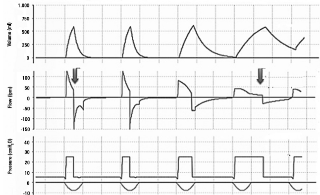
Figure 3 - Cycling asynchronies during pressure support ventilation. In the first cycle, the cutoff point of 25% of the peak inspiratory flow (percentage of the cycling criterion) was reached rapidly; the ventilator's inspiratory time was therefore shorter than the time desired by the patient. This is shown in the expiratory segment of the flow curve, which tends to return to the baseline as a result of the patient's inspiratory effort, which is still present. The last cycle represents the opposite situation, i.e., delayed cycling. The flow reduction occurs very slowly, which is typical of airway obstruction; the cycling threshold is therefore reached with some delay. Sometimes, the cycle is interrupted by a contraction of the respiratory muscles, which causes an increase above the support pressure adjusted at the end of inspiration (not shown in this figure). Figures obtained at Xlung.net, a virtual mechanical ventilation simulator. Available at: http://www.xlung.net

Comment - In delayed cycling, the ventilator's mechanical inspiratory time is longer than the time desired by the patient; in other words, the ventilator cycling time is longer than the patient's neurally controlled inspiratory