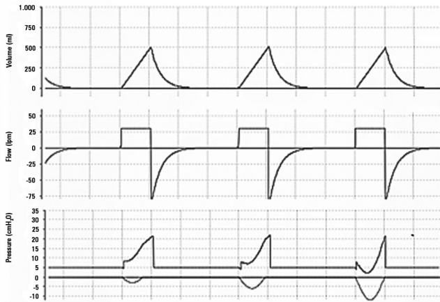
Figure 2 - Flow asynchrony. In volume-controlled mode, the flow rate was adjusted below the patient's demand; the patient thus maintained muscle effort throughout inspiration, and the curve consequently became concave and upward. The asynchrony exhibits increasing intensity from the first to the third cycle, as represented in the figure. The negative deflections in the pressure-time curve represent the patient's inspiratory effort (muscle pressure) and are only visible when esophageal pressure is monitored.