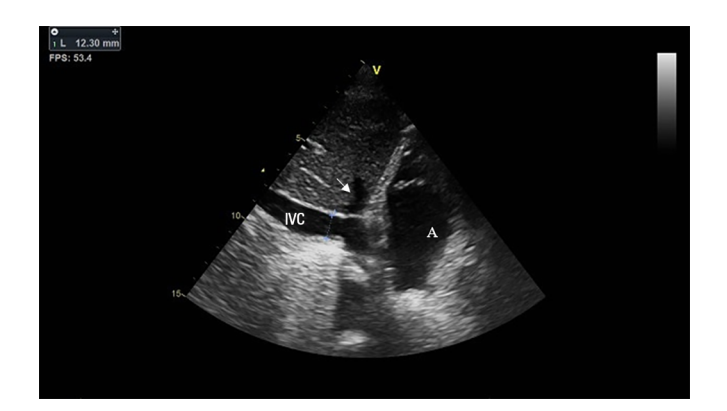
Figure 2 - Inferior vena cava diameter measurement technique. The inferior vena cava should be measured in two-dimensional mode at the subcostal window using the long axis distal to the hepatic vein (arrow), approximately 1 - 3cm from the entrance of the inferior vena cava in the right atrium (A). Measurements near the right atrium entrance or near the diaphragm should be avoided. Its diameter can also be measured in M mode simultaneously with the two-dimensional mode to ensure the perfect alignment of the probe, perpendicular to the long axis of the inferior vena cava. In patients under invasive mechanical ventilation, the diameter of the inferior vena cava at the end of expiration (minimum diameter) is measured to calculate the distensibility index. The probe must be kept in a fixed position during the respiratory cycle. Image obtained with a GE Vivid T8 echocardiograph. IVC - inferior vena cava.

subcostal window using the long axis. Measurements should be performed in the two-dimensional mode distal to the hepatic vein (i.e., approximately 1 - 3cm from the IVC entrance in the right atrium; Figure 2).<sup>(15-17)</sup> The IVC diameter can also be measured in M mode, although a perfect probe alignment perpendicular to the long IVC axis is necessary. This measure implies the simultaneous use of the M and two-dimensional modes, with constant visualization of the IVC walls.