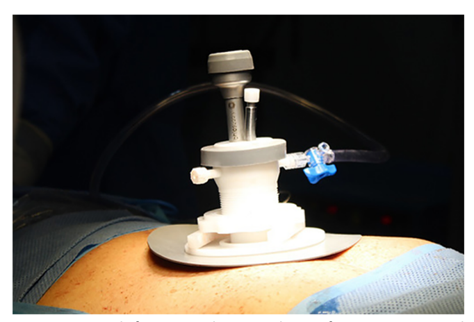
Figure 2. Multifunction BhioQap device for intraperitoneal delivery of chemotherapeutic agents.

BhioQap unidirectional device for aerosolization of intraperitoneal chemotherapy (Figure 2), and consists of the following sequence of procedures.