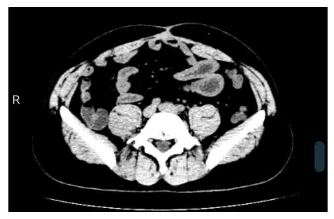
Figure 5. Postoperative abdominal tomography.

80% of all ventral hernia<sup>6</sup>. Incisional hernia repair is a common surgical procedure and has long been a problem with no standard surgical treatment, and a significant postoperative morbidity. Laparoscopic repair has a lower postoperative morbidity. Nowadays, the use of laparoscopic ventral hernia repair is limited to patient and hernia factors<sup>19,20</sup>.