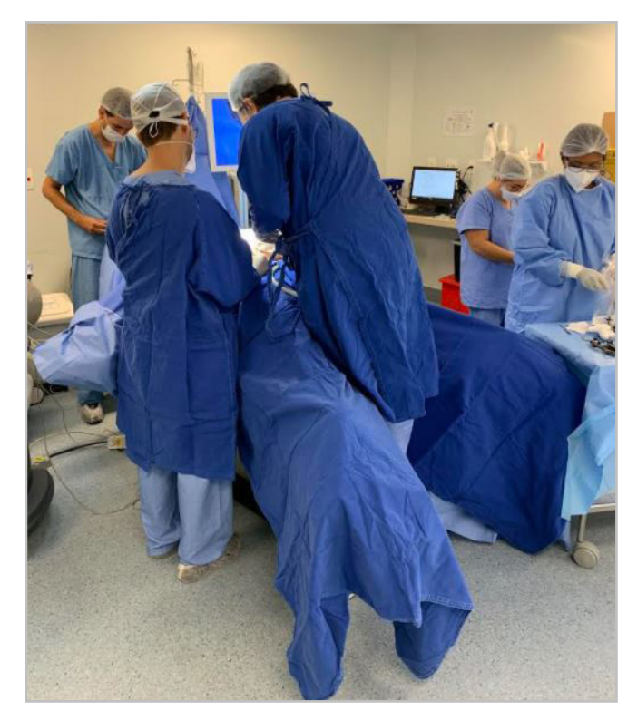
Figure 3. Position of the patient and the surgeon for the procedure.

We set three trocars in a line up along an imaginary path of the Pfannenstiel incision. The first one, a 20mm incision, transversal, and median, was carried out and reached the aponeurosis. Through a blunt dissection, we created an 8-10cm subcutaneous space laterally and towards the umbilicus. A 12mm trocar was inserted and fixed to the incision with a nylon suture avoiding CO<sub>2</sub> ecaping. Then, two additional 5mm trocars were bilaterally positioned line up along the imaginary path (Figura 4).