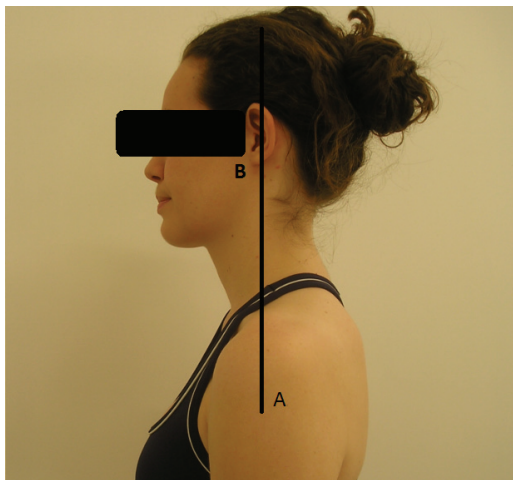
Figure 1 – (a) center of the shoulder joint; (b) earlobe. The volunteer shows a slightly anteriorized position of the head observed by postural inspection of the head on the sagittal plane

on his lower limbs, looking ahead and with his arms along the body. In a lateral view (sagittal plane), the examiner observed if there was anteriorization or posteriorization of the head in relation to the shoulders. To this end, an imaginary vertical line was traced from the center of the shoulder joint to the earlobe. When this imaginary line passed the earlobe posteriorly, head anteriorization was considered to be present and when it passed the earlobe anteriorly, head posteriorization was considered to be present 16 (Figure 1).