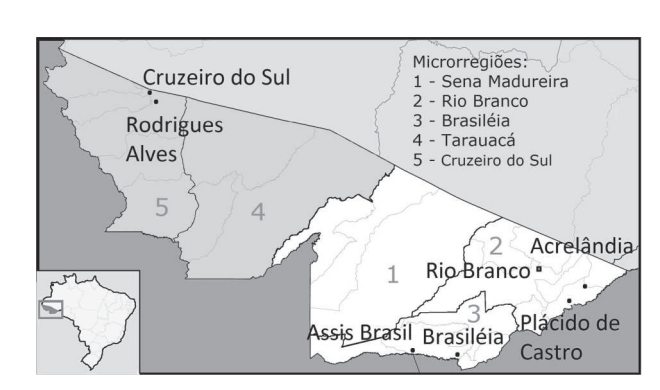
Figure 1 . Location of meso and microregions and the source municipalities of the genetic material of Piper hispidinervum and P. aduncum in. Acre Valley mesoregion: 1 = Sena Madureira, 2 = Rio Branco, 3 = Brasiléia; Juruá mesoregion: 4 = Tarauacá, 5 = Cruzeiro do Sul.

The characterization of the canopy morphology of individuals is of great importance since it brings estimates of the aerial biomass yield, which affects the production of essential oil according to the yield and contents of the major compounds. This information provides grants for identification and subsequent selection of superior populations that will support the breeding program. As a result, for the populations of P. hispidinervum present in ABG, the average of the estimated canopy volume was 6.30 m<sup>3</sup>, with an average height of 2.39 m and canopy diameter of 2.18 m (Table 1). As for the populations of P. aduncum, the average volume and height observed were higher, with an average canopy volume of 7.78 m<sup>3</sup>, 2.70 m of height and 2.32 m canopy diameter (Table 3). Under native conditions, without management or pruning for canopy formation, Miranda et al. (2002) observed more frequency for the 1-10 individual class every 100 m<sup>2</sup>, with average values of canopy height and diameter of 5.07 and 2.10 m, respectively. However, there was a concentration of leaves and thin branches in the upper third of the canopy, making it difficult to cut. The coefficient of variation (CV%) of the morphological variables was considered high (> 30%) for leaf length and canopy volume, and