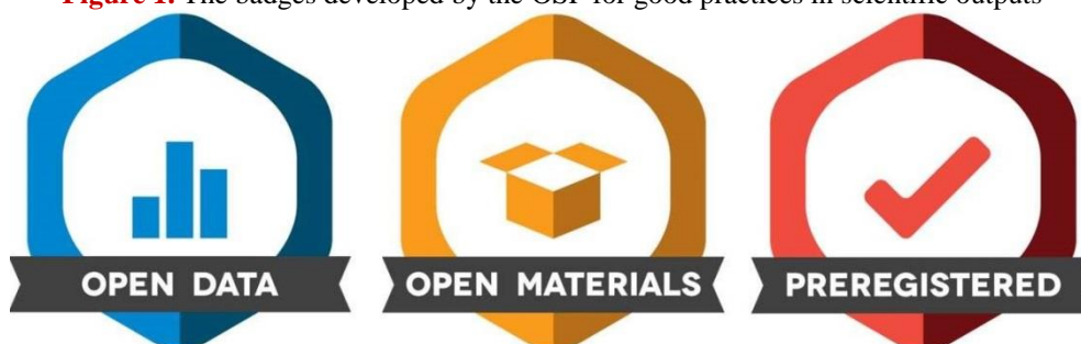
Figure 1. The badges developed by the OSF for good practices in scientific outputs

Noteworthy here is the work of the Open Science Framework (OSF), an effective proposal for good scientific practice, offering a solution for how it can be attained. This system features three badges which are: Open Data, Open Materials, and Preregistered, as seen in Figure 1 below: