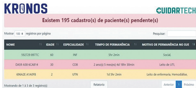
Caption: Existem 195 cadastros(s) de paciente(s) pendentes - there are 195 patient registers pending; Mostrar "100" registros por página - show "100" register per page; Pesquisar - search; Nome - name; Idade - age; Especialidade - specialty; Tempo de permanência - length of stay; Motivo de permanência no SUE - reason for stay in SUE; INF - CHILD; Social - social; 2 ano(s) 5 mês(es) - 2 years and 5 months; Leito de UTI - ICU bed; UTN - NICU; Leito de enfermaria - ward bed; Hemodíalise - hemodialysis; Mostrando de 1 à 3 de 3 registro(s) - showing from 1 to 3 of 3 registers; Relatório - report; Anterior - previous; Próximo - next.