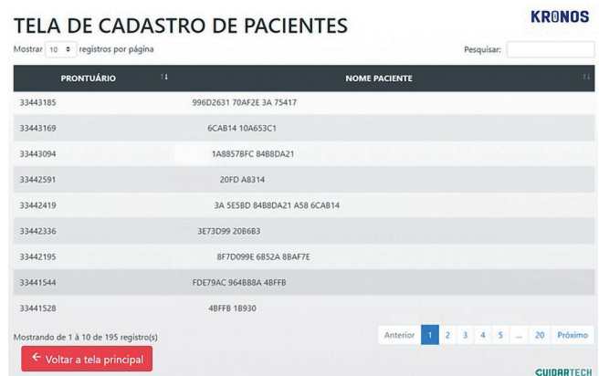
Caption: Tela de cadastro de pacientes - patients' registration screen; Mostrar "10" registros por página - show "10" registers per page; Prontuário - record; Nome Paciente - patient's name; Mostrando de 1 à 10 de 195 registro(s) - showing from 1 to 10 of 195 registers; Anterior - previous; Próximo - next; Volta a tela principal - back to main screen.