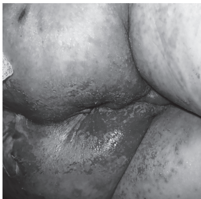
Figure 1 - Incontinence-associated dermatitis - acute inflammatory phase associated with candidosis, perianal, gluteal, and sacral region

Table 1 shows results related to intrinsic factors and their associations with IAD. There was a statistically significant association with IAD, obesity (OR = 3.6 [1.2-10.4]), high level of dependence (OR = 2.4 [1.1-5.0]), very high risk to PS according to the Braden Scale [OR = 6.1 (1.4-26.9)].