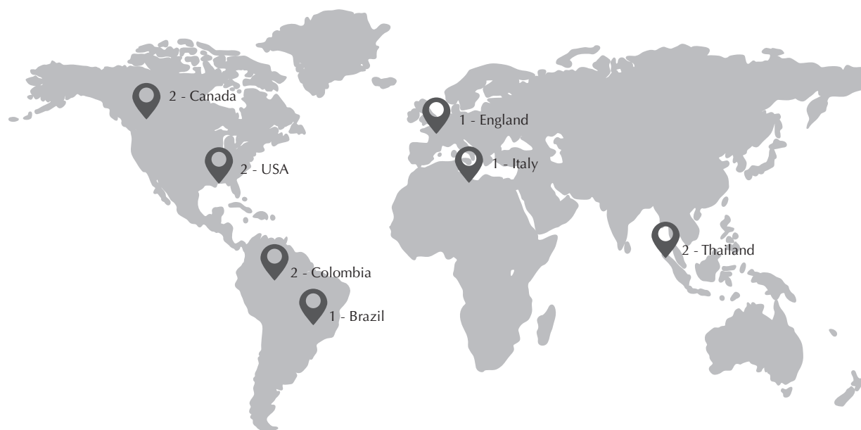
Figure 2 – Geographic scope of the research between 2010 and 2015 – Portugal, 2016.

qualitative and five were quantitative. They were distributed as illustrated in Figure 2, in the following countries: Canada, USA, Brazil, Colombia, England, Italy and Thailand.