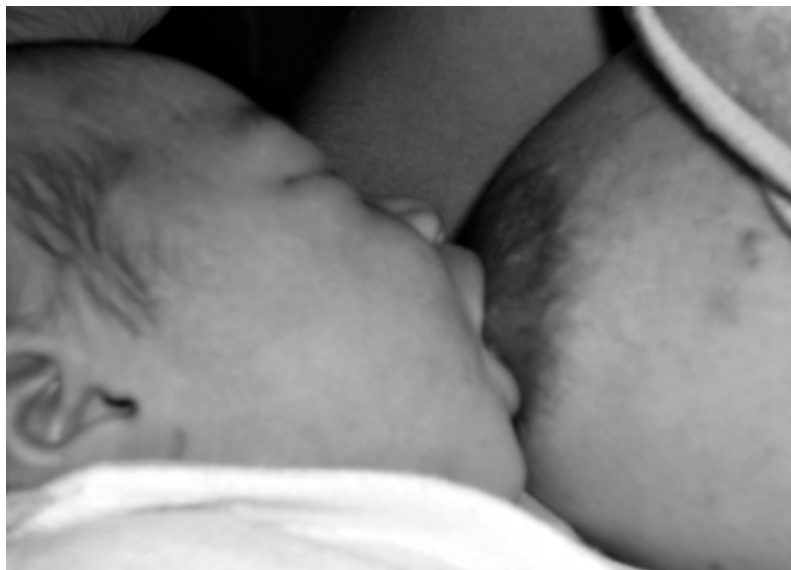
Figure 2 - Correct infant attachment at breastfeeding.

Efficient suction is directly related to a satisfactory attachment, and this action can certainly prevent breastfeeding trauma, dental arch wire alteration, mouth breathing syndrome, atypical swallowing, and phonoarticulatory alterations (16) .