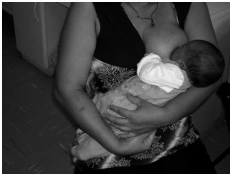
Figure 1 - Correct infant position at breastfeeding.

As per the characteristics of the correct breastfeeding position, the infant's body has to be close to and directed at the mother, his buttocks must be supported, his head and body must be aligned with the mouth, on the same horizontal line to the breast, facing the areola (9,15) (Figure 1). The correct attachment to the nipple-areola region is an important step to trigger the breastfeeding process. The infant's lips must be turned outwards, his mouth wide open, round cheeks, and the chin must touch the mother's chest (7) (Figure 2).