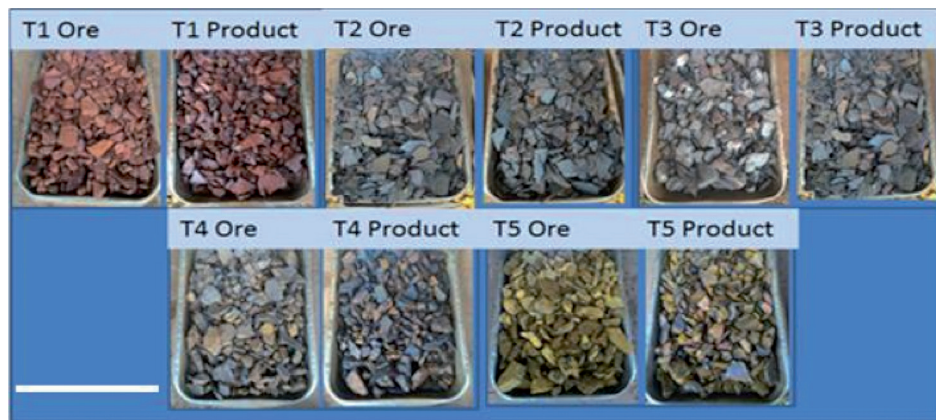
Figure 3 Typologies before and after laboratory metallurgical tests. T1, T3 and T5 presented a significant increase in Fe content, due the elimination of LOI, SiO 2 , and Al 2 O 3 particles. Bar scale (300 mm).

From January to June/2015, industrial tests were performed to calibrate the model, at least 50 batches for each typology. During a batch, the industrial plant feeding was restricted to a specific