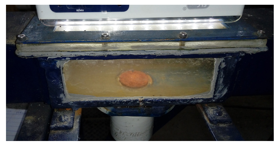
Figure 2 - Sample positioning to start the erodibility test.