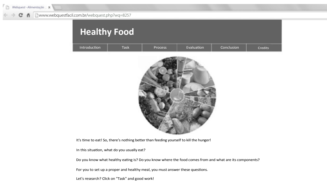
Figure 1- WebQuest Homepage. Porto Alegre, 2017

The stages of the WebQuest were the ‘introduction’, with brief text presenting the objectives of the activity and encouraging the students to take interest in the theme. In the second stage, called ‘task’, it was presented what a blog was and the proposal of elaboration of it. The opening page of the WebQuest with the structure of the steps to be performed by the students is presented in Figure 1.