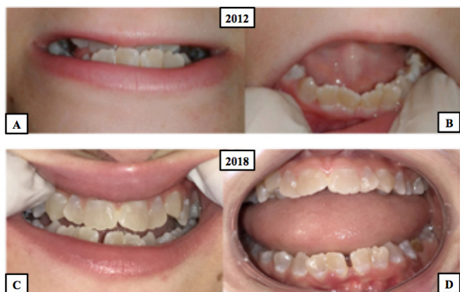
Figure 2. Clinical oral examination showing anterior crossbite and DGI in 2012 (A and B) and 2018 (C and D).

The radiographic examinations performed in 2012 and 2018 revealed pulp chamber obliteration in both primary and permanent teeth (figure 3).