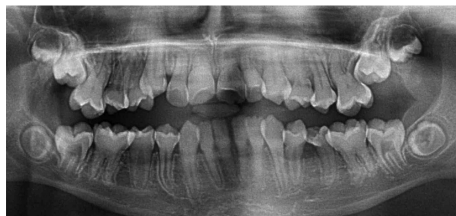
Figure 4. Panoramic radiography showing 1:1 proportion of maxillary incisor crown to root and complete obliteration of pulp chamber in permanent dentition (2018).

In 2012, the treatment plan was organized as prophylaxis, surgical treatment and maintenance phase (follow up). Before the clinical procedures, the clinician managed the child's behavior to ensure cooperation and safe treatment.