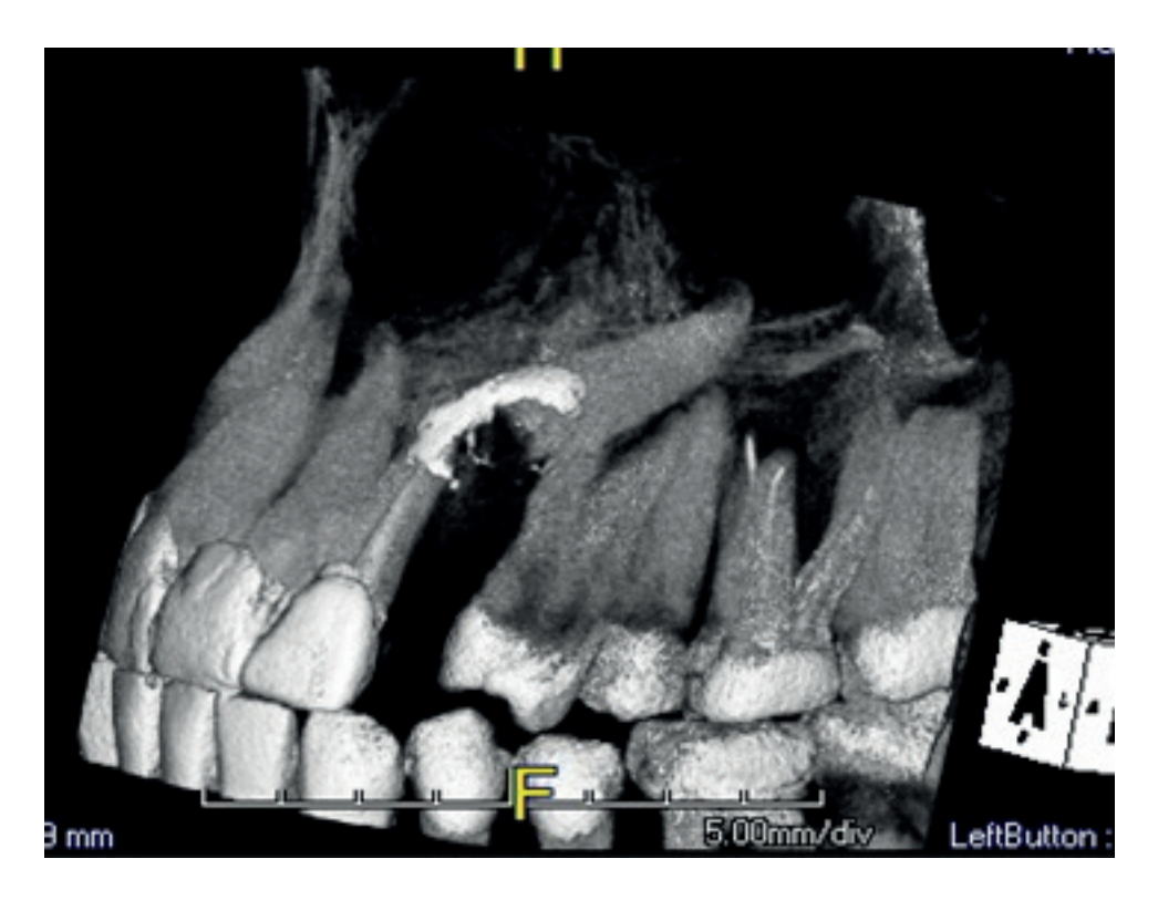
Figure 1. Three-dimensional image showing the spatial positioning of the tooth 23.