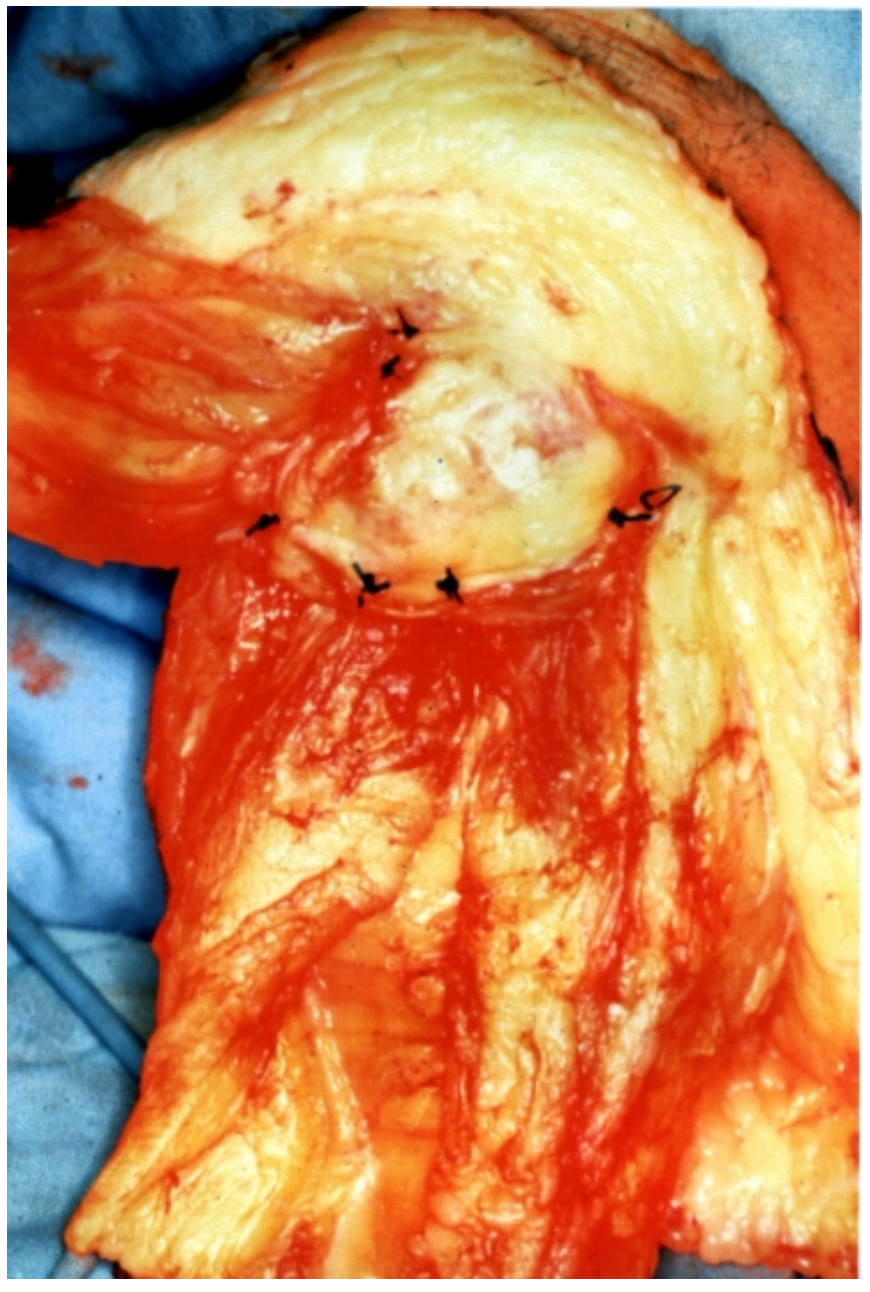
Figure 2 - Osteoperiosteal cylinder.

when the orthopedic prosthesis could be used painlessly and when the bone bridge was consolidated. Results were considered "bad" when bone spiculae formed and/or patients presented with pain at the amputation stump, thus making prosthesis use impossible. According to these criteria, the obtained results where "good" in 14 (93%) operations and "bad" in only one.