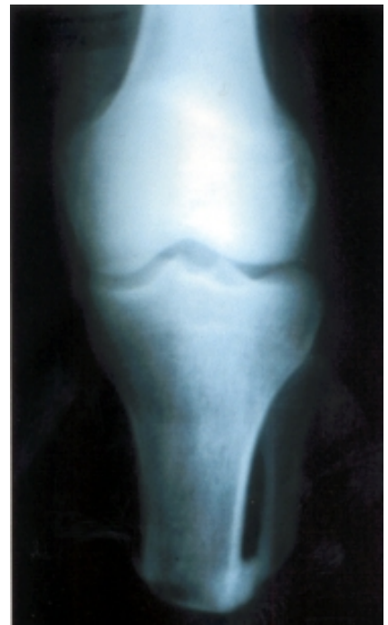
Figure 4 - Radiologic establishment of the bone bridge.

Delayed changes in the amputation stump are common reasons that patients seek medical treatment after prosthesis adaptation. Following a classic