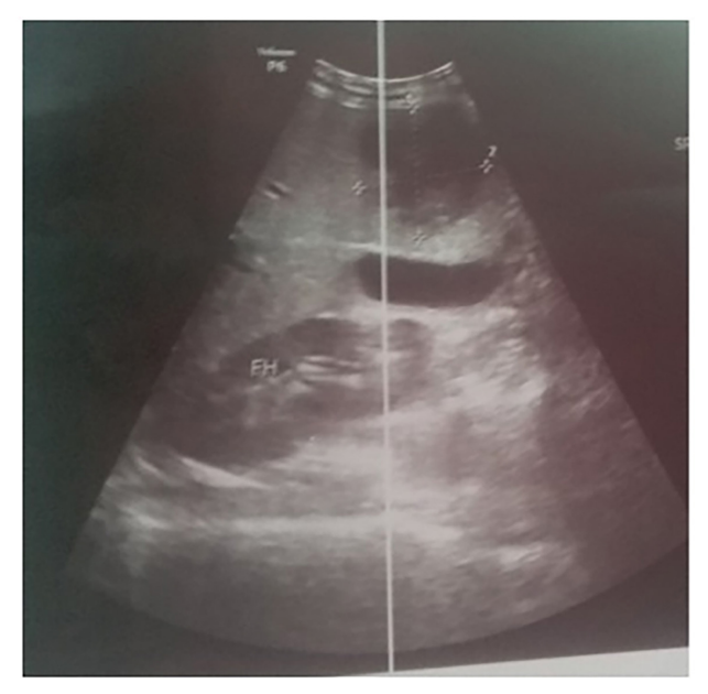
Figure 1 - Ultrasound of the liver showing an abscess due to Salmonella sp. at the level of the segment IV associated with hepatomegaly: 1 = 5.8 cm; 2 = 4.2 cm; FH = size of hepatomegaly.

largest lesion measured 5.8 by 4.2 cm with hepatomegaly associated with an anechoic peritoneal effusion of moderate abundance (Figure 1). The patient was treated empirically with ceftriaxone, metronidazole and gentamicin for the liver abscesses, fluconazole for oral and esophageal candidiasis, and a medication to slow down the intestinal transit.