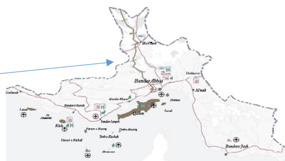
Fig. 1 - Map of Iran and Hormozgan province ( http://geology.com/world/iran-satellite-image.shtml , http://www.operationworld.org/iran , http://www.irantravel.biz/iran_maps/hormozgan_province.gif ).