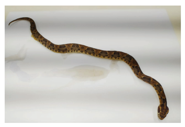
Figure 1 - Bothrops erythromelas

A 57-year-old man without previous comorbidities was bitten by a Bothrops erythromelas on his right ankle. He killed the snake and applied a tourniquet above the snakebite and attempted to extract the venom, a popular traditional treatment of snakebites in the locality where he lives. He was transferred to the Poison Control Center in the Instituto Doutor Jose Frota, a tertiary hospital in Fortaleza city, Ceara State, Northeast of Brazil. He was admitted 5 h after the snakebite and brought the snake, permitting its identification (Figure 1). On admission the patient presented with local pain, swelling and bleeding at the punctured site. Blood was collected and the laboratory findings were analyzed periodically (Table 1).