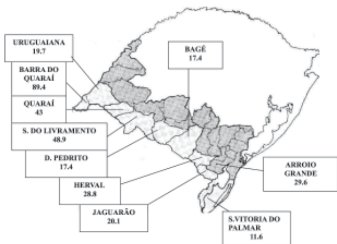
Fig. 1 - Prevalence of human cystic echinococcosis in some municipalities of endemic areas from Rio Grande do Sul State (/100,000 inhabitants-1999).

An interesting survey was finished in 1999 by the Health Secretary from Rio Grande do Sul State 16 evaluating 7,415 inhabitants out of a total population of 140,665 which live in rural areas from the 18 municipalities that belong to the endemic zones (Some of them are presented in Fig. 1). An ELISA technique was performed in approximately 5% of the total population of rural inhabitants. Results showed different patterns in sero-prevalence and infection rate varied from 8.82 to 89.44 per 100,000 inhabitants without easy interpretation.