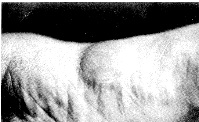
Fig. 1.- Tumefaction in the cavum of the right foot. Note the inexistence of draining sinuses.