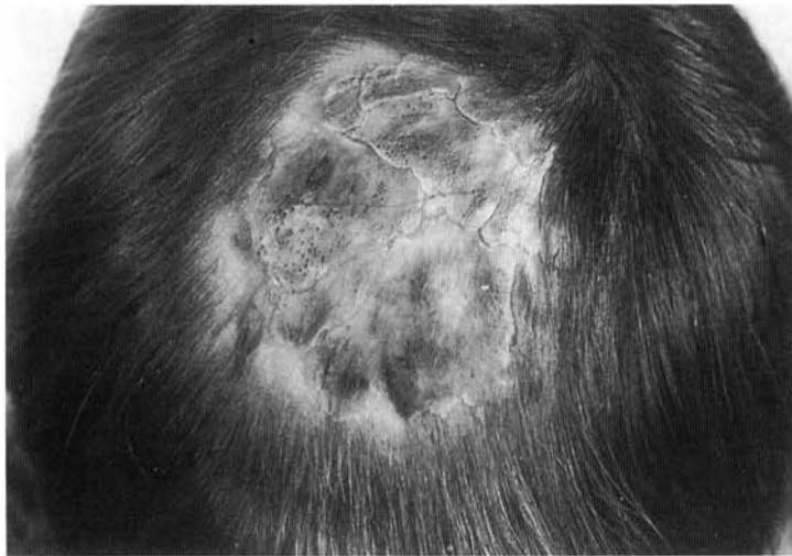
Fig. 2 - Kerionlike lesion of the scalp due to A. kiliense after one month of treatment.

ma 5 , meningitis 8,17 , endocarditis 6,12 , cerebritis 27 , osteomyelitis 2 and peritonitis 13 . Two cases of mixed Acremonium and Staphylococcus aureus infection of hemodialysis fistulae were reported 16 . Onycholysis and subcutaneous nodules involving both forearms due to