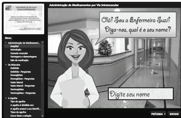
Figure 2 – Initial Screen of the Learning Object (LO) Intramuscular Medication Administration (IM), São Paulo, SP, Brazil, 2013

The themes addressed in the LO were: advantages and disadvantages of this route; identification and anatomy of the muscles: deltoid, dorsogluteal, vastus lateralis, ventrogluteal; presentation of different needle types and sizes; demonstration of asepsis technique and of IM procedure and main complications.