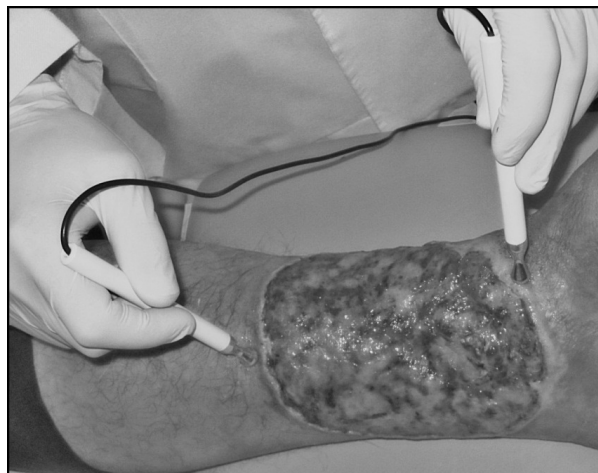
Figure 2 – Microcurrent application to the ulcer

border was contoured, with a one-centimeter distance between application points, returning to the initial point at the end of the application. To guarantee that the entire ulcer border would receive the stimulation, at the end of the application to the points, the application was extended for another minute, sliding the pen around the entire border. Hence, the application time was directly proportional to the ulcer area. The subjects received ten applications, three times per week, for four weeks (Figure 2).