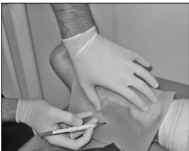
Figure 1 – Delimitation of the ulcer area contours on vegetal paper

To apply planimetry, a vegetal paper with 70% alcohol was placed on the ulcer and fixed to contour the ulcer border, using a pen. After marking the ulcer on the vegetal paper, two methods were employed to determine the total ulcer area: 1) superposition of the vegetal paper on millimeter paper (23) , and counting of the number of squares in the ulcer area to determine its area in square millimeters (mm 2 ); 2) digitalizing of images obtained on the vegetal paper for measuring using Image J ® software (24) , compared with the known area of a standard reference (Figure 1).