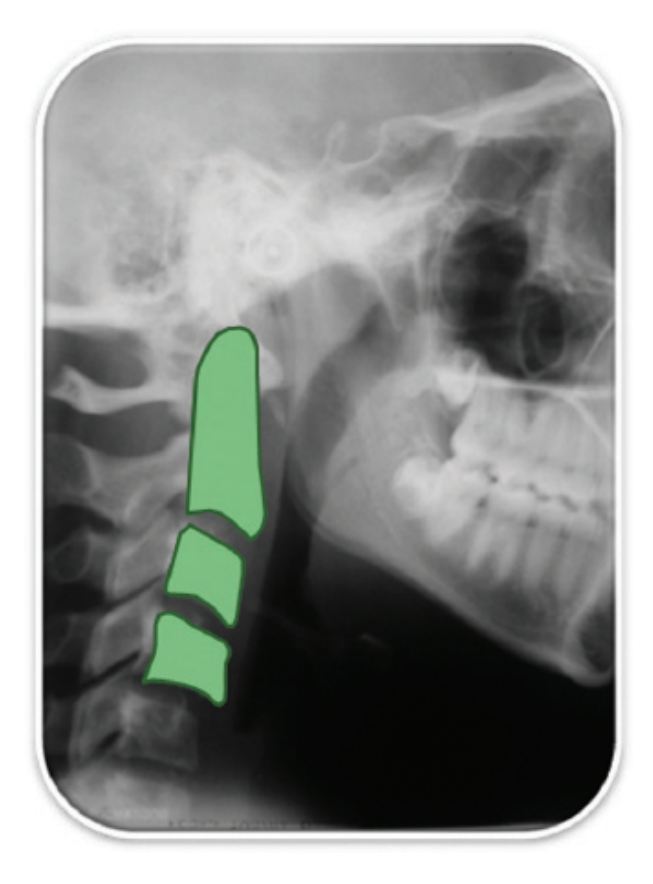
Fig. 2. Lateral cephalometric radiography of an individual in CVMI stage 3. It can be observed the presence of concavities on C2, C3 and C4 lower borders. C3 and C4 vertebrae bodies are rectangular with a broader horizontal width.

Stage 9 - G2 = radio-opaque kook clearly visible in body of the hooked bone;