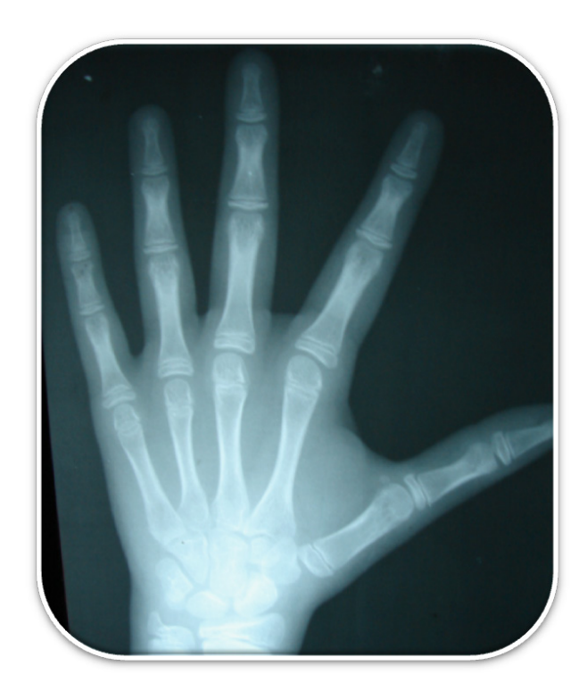
Fig. 1. Hand and fist radiography of an individual that was in SMI stage 8. The sesamoid bone is observed.